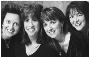
Four Bitchin' Babes